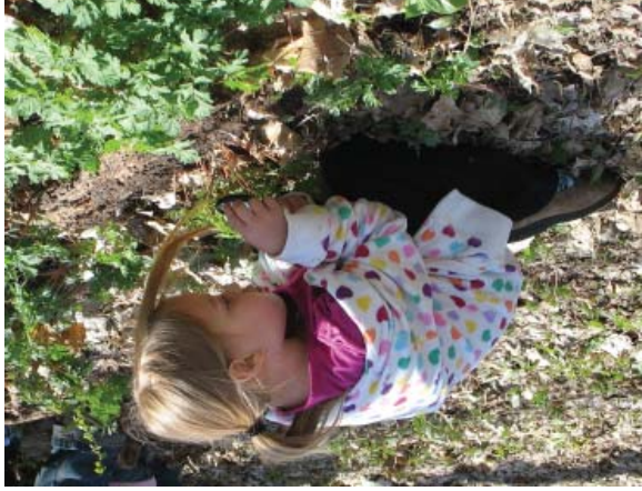
Home school programs are available. This young student examines signs of spring - up close!

For more information about county park locations, amenities and additional activities, visit our web site at www.sjspark.org .