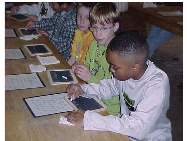
^^Students use slate & chalk in the mock one-room schoolhouse to practice penmanship, during the Pioneer Skills program.