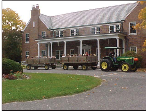
Tractor drawn hayrides at Bendix Woods County Park

For more information log onto sjcparks.org and check out our calendar of events.