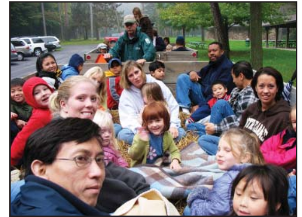
Morning hayride outings are perfect for school groups!

A great idea for school groups and company outings! No campfire, but everything else is the same as the evening hayride options. Adult groups may request a campfire for an additional $35 at the time of reservation.