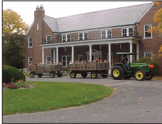
Tractor drawn hayrides at Bendix Woods County Park.